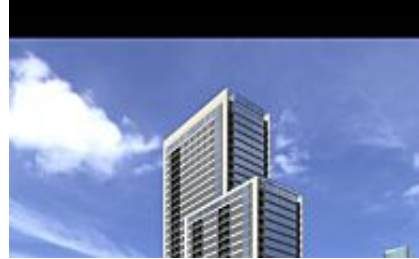
Two more large office projects gear up to break ground in downtown Austin