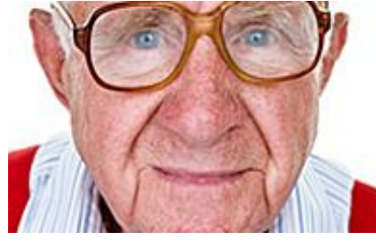
14 Financial Mistakes You Should Never Make After 50