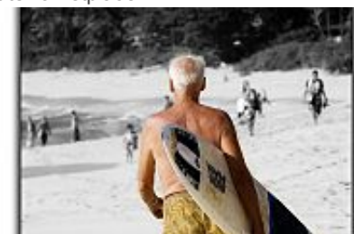
Please Don't Retire At 62. Here's Why. The Motley Fool