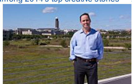
Mueller development going strong with new retail, arts facilities, residential growth