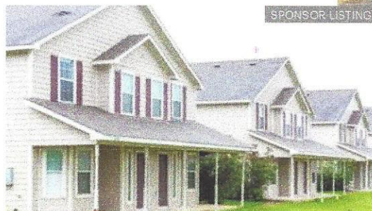
Property Spotlight: The Meadows at Prairie View